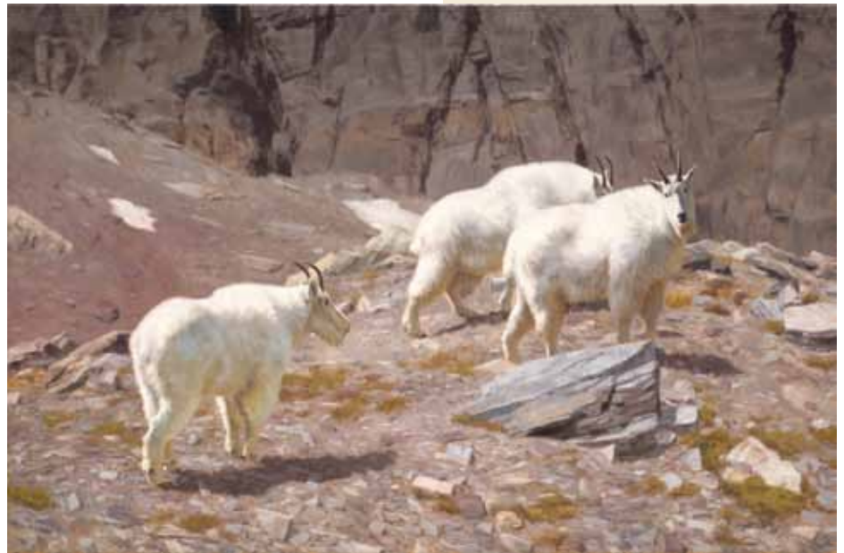
Headed for New Heights , oil, 40 x 60.

Prix de West Invitational , Oklahoma City, OK, June. Group show, Trailside Galleries , Jackson, WY, September.