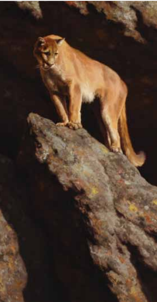
▲ High Rise , oil, 50 x 28. ▼ Making Him Work for It , oil, 42 x 60.