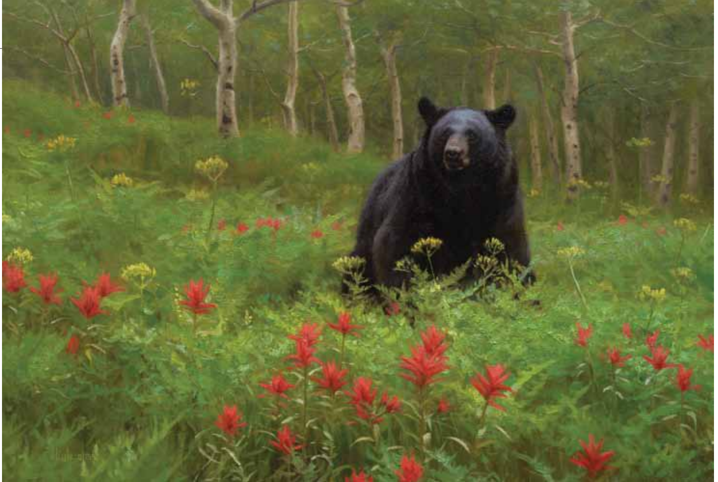
Delights of July, oil, 24 x 34.

calf make their way below. “I was able to see great interaction, herding behavior, little head gestures, subtleties you pick up on,” Sims says of the time spent observing these iconic creatures. “Eventually it gets ingrained, and you remember it.”