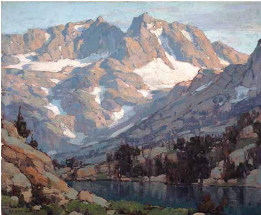
EDGAR PAYNE (1883-1947) "Big Pine Lake" | Oil on canvas | 28"x34"