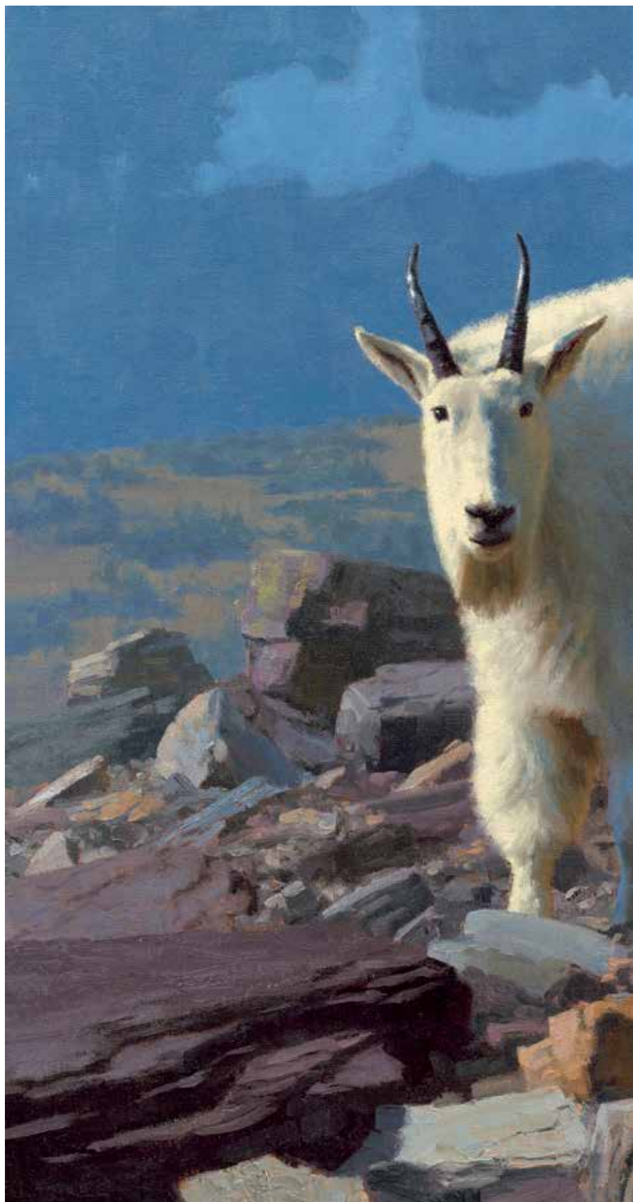
Glacier Day Hike