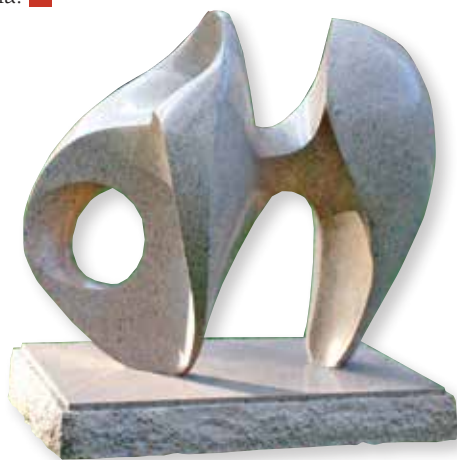
Dance with Wisdom

In the United States, his work is represented by Glenn Green Galleries, Tesuque, New Mexico and Scottsdale, Arizona. ■