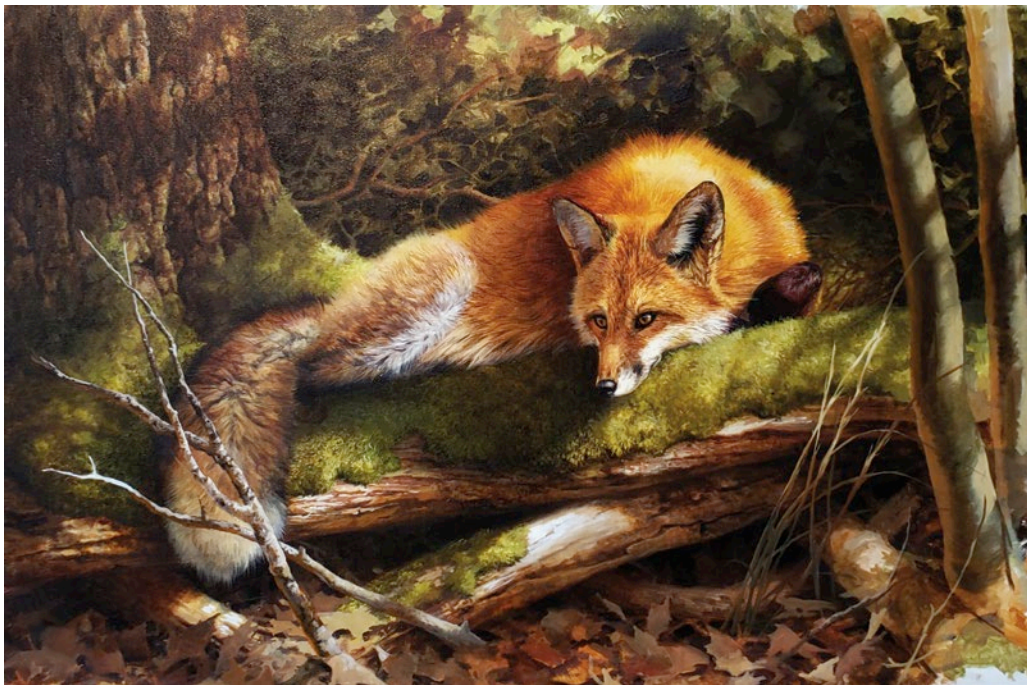
Farewell to Summer , oil on canvas, 24 x 36"