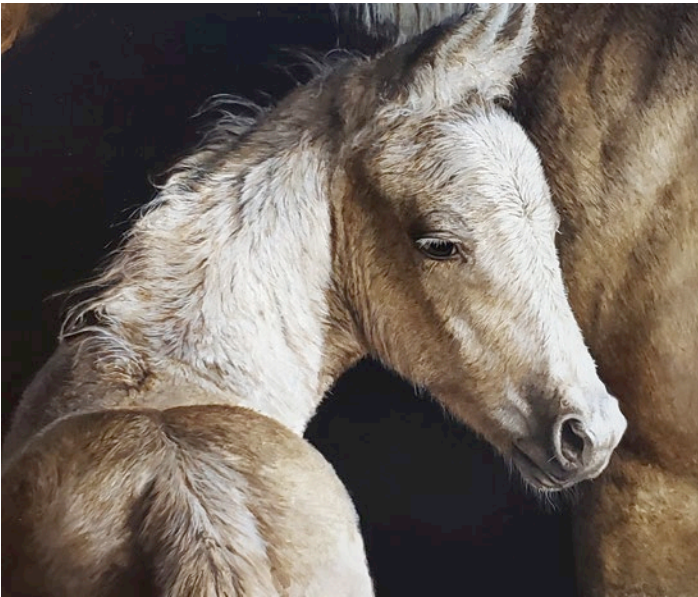
Palomino Filly , oil on canvas, 24 x 30"