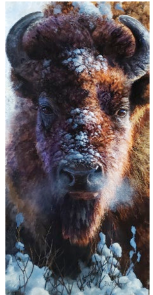
Winter Buffalo , oil on canvas, 24 x 12"

butterflies are going to leave, too. Kind of sad."