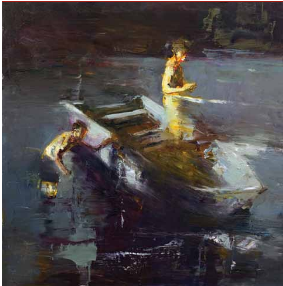
Disappearing Youth, oil, 24 x 24.