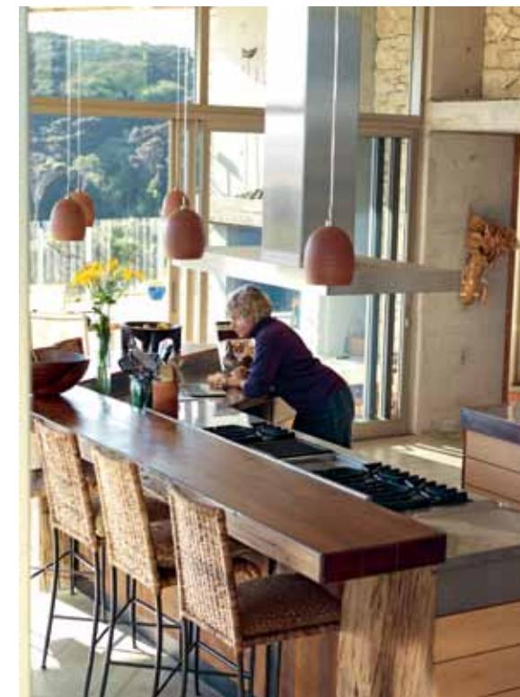
The view from the front door looks down into the kitchen and the breakfast bar constructed by Brian; both enjoy cooking and showing off their culinary skills to frequent overseas guests; expansive amounts of glass blur the line between inside and out.

Lindsay was a biologist by profession but when she lived in Sedona in Arizona she had considerable success with her true passion – drawings of African wildlife. Sedona had a vibrant art