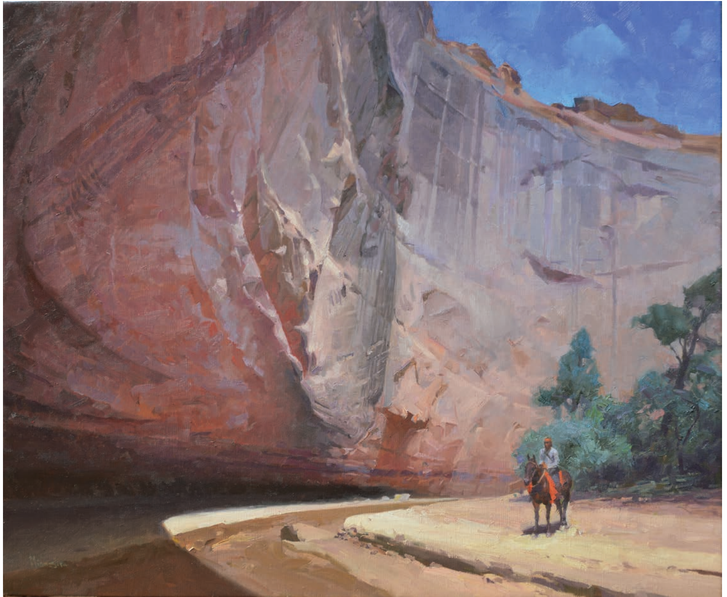
MIAN SITU, Walls That Speak , oil on canvas, 20 x 24 inches, $14,500