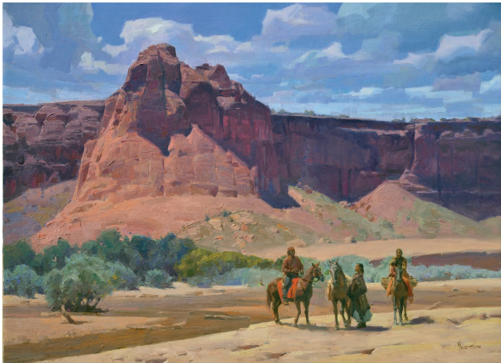
MIAN SITU, Waiting , oil on canvas, 22 x 30 inches, $19,000