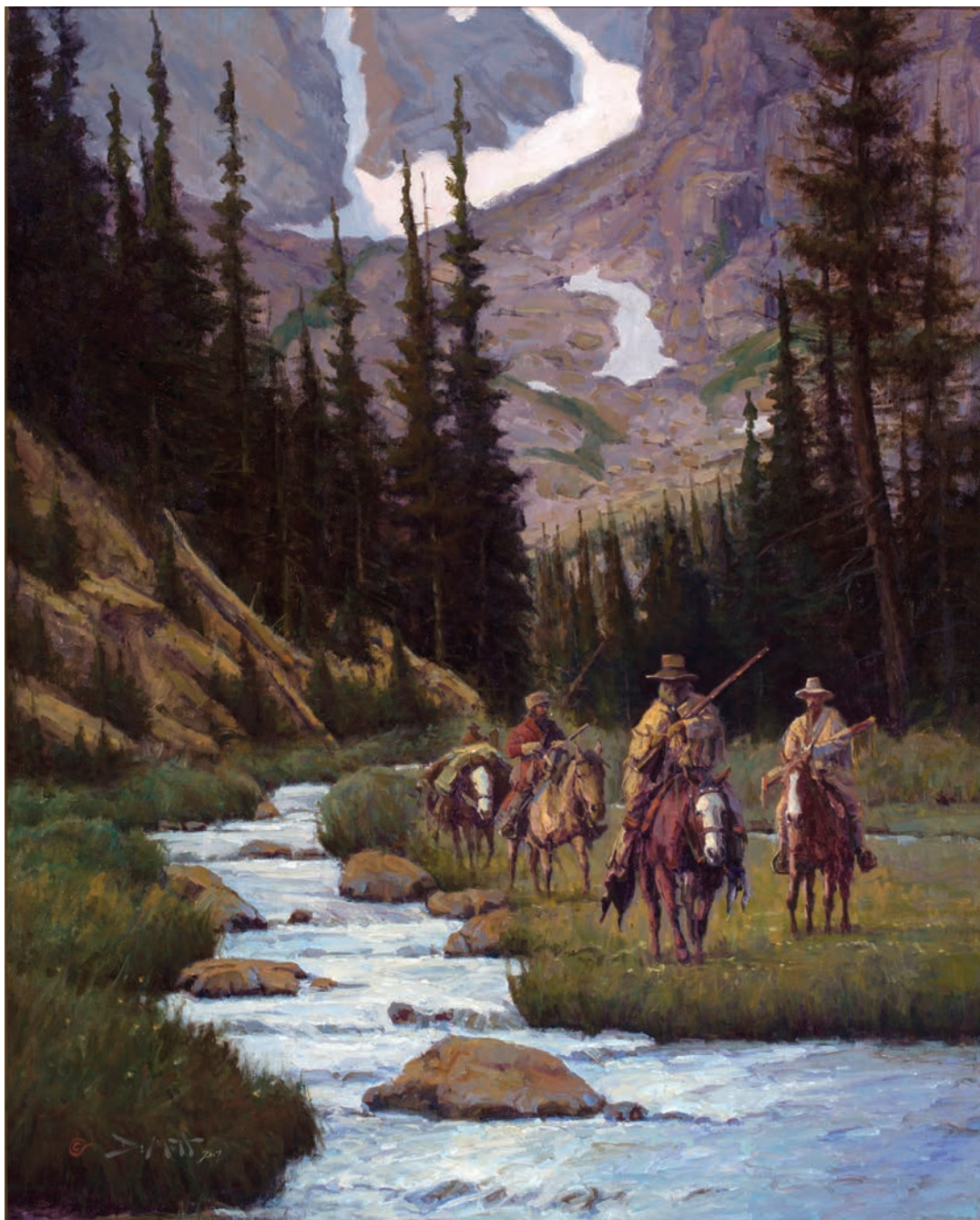
JOHN DEMOTT The Mountain Men oil on canvas 30 x 24 inches $17,000