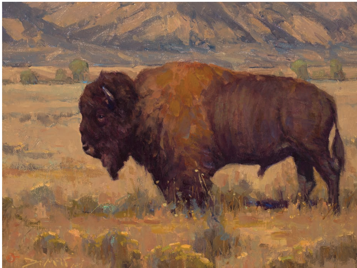
JOHN DEMOTT, Bison , oil on canvas, 9 x 12 inches, $3,200