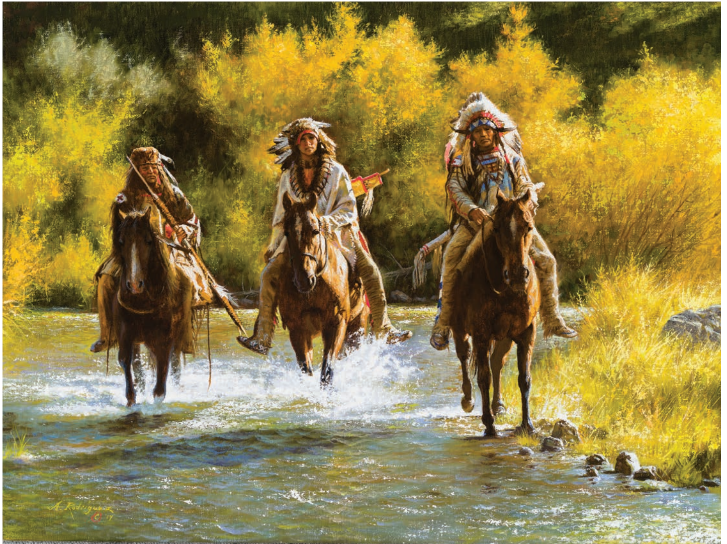
ALFREDO RODRIGUEZ, Leaving No Tracks , oil on linen, 18 x 24 inches, $10,500