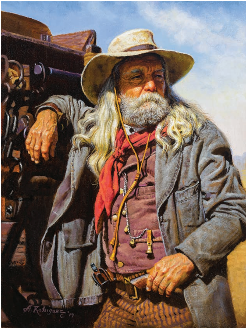
ALFREDO RODRIGUEZ, The Wagon Boss , oil on linen, 12 x 9 inches, $4,500