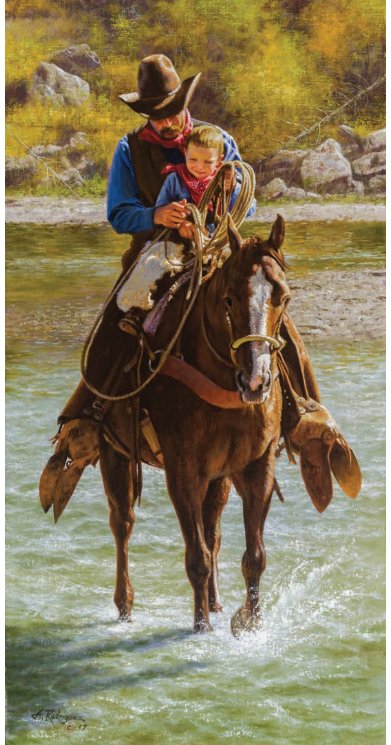
ALFREDO RODRIGUEZ Almost There oil on linen 24 x 12 inches $9,500