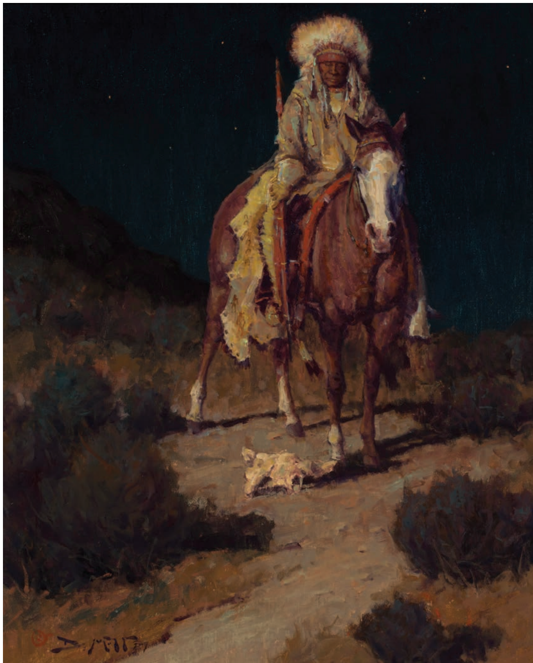
JOHN DEMOTT A Time Not Forgotten oil on mounted linen 20 x 16 inches $8,500