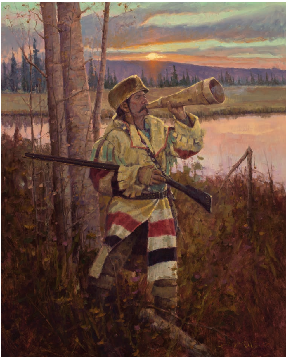
JOHN DEMOTT Moose Caller oil on canvas 30 x 24 inches $16,500