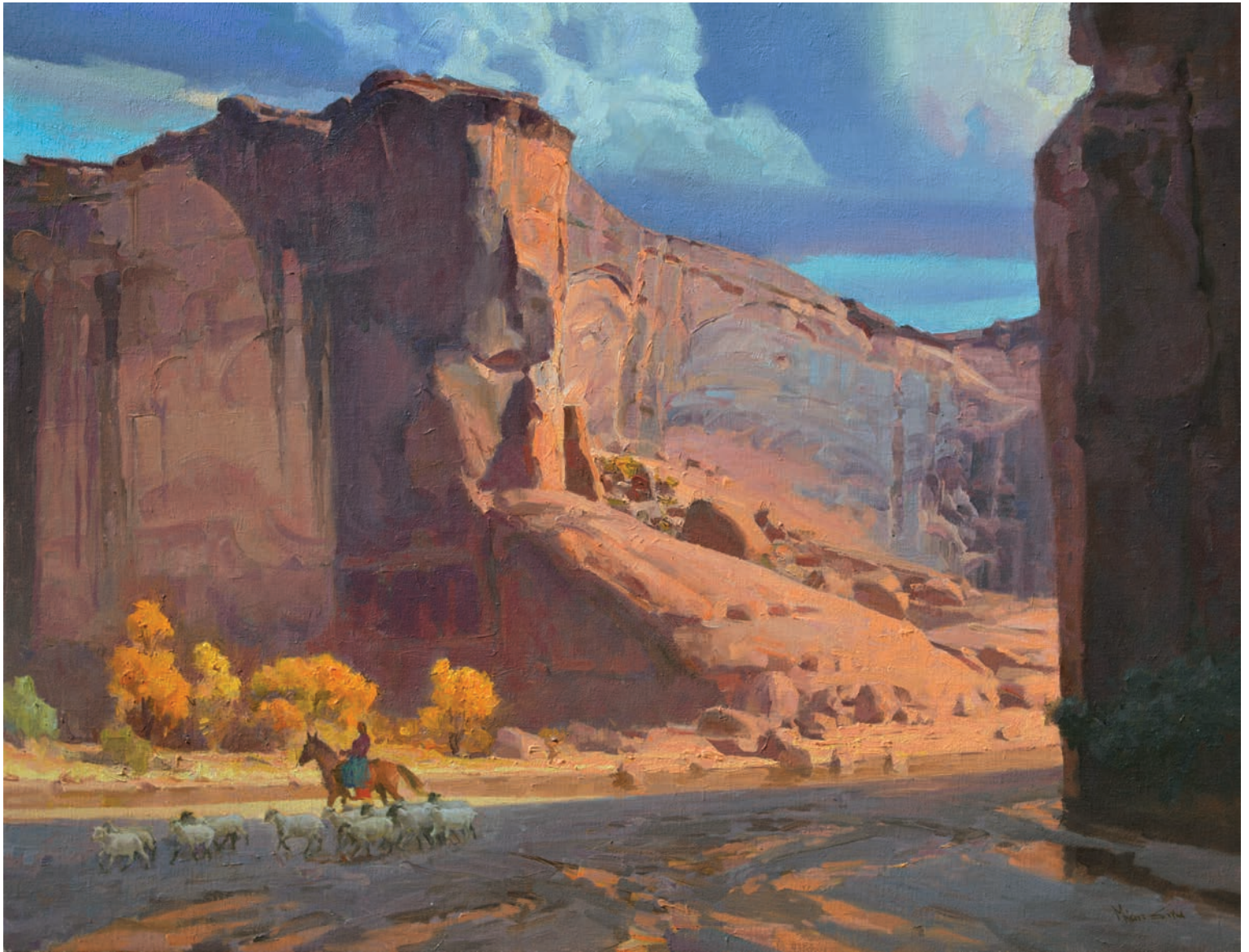
MIAN SITU, Canyon Shadows , oil on canvas, 20 x 26 inches, $15,000