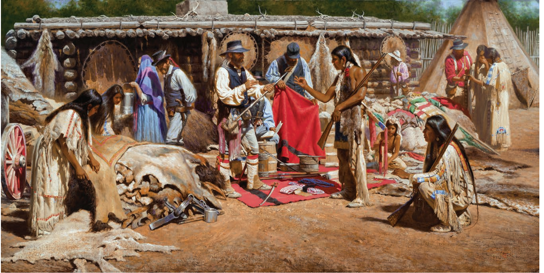
ALFREDO RODRIGUEZ, Trading at Fort Robidoux 1832 , oil on linen, 24 x 48 inches, $30,000