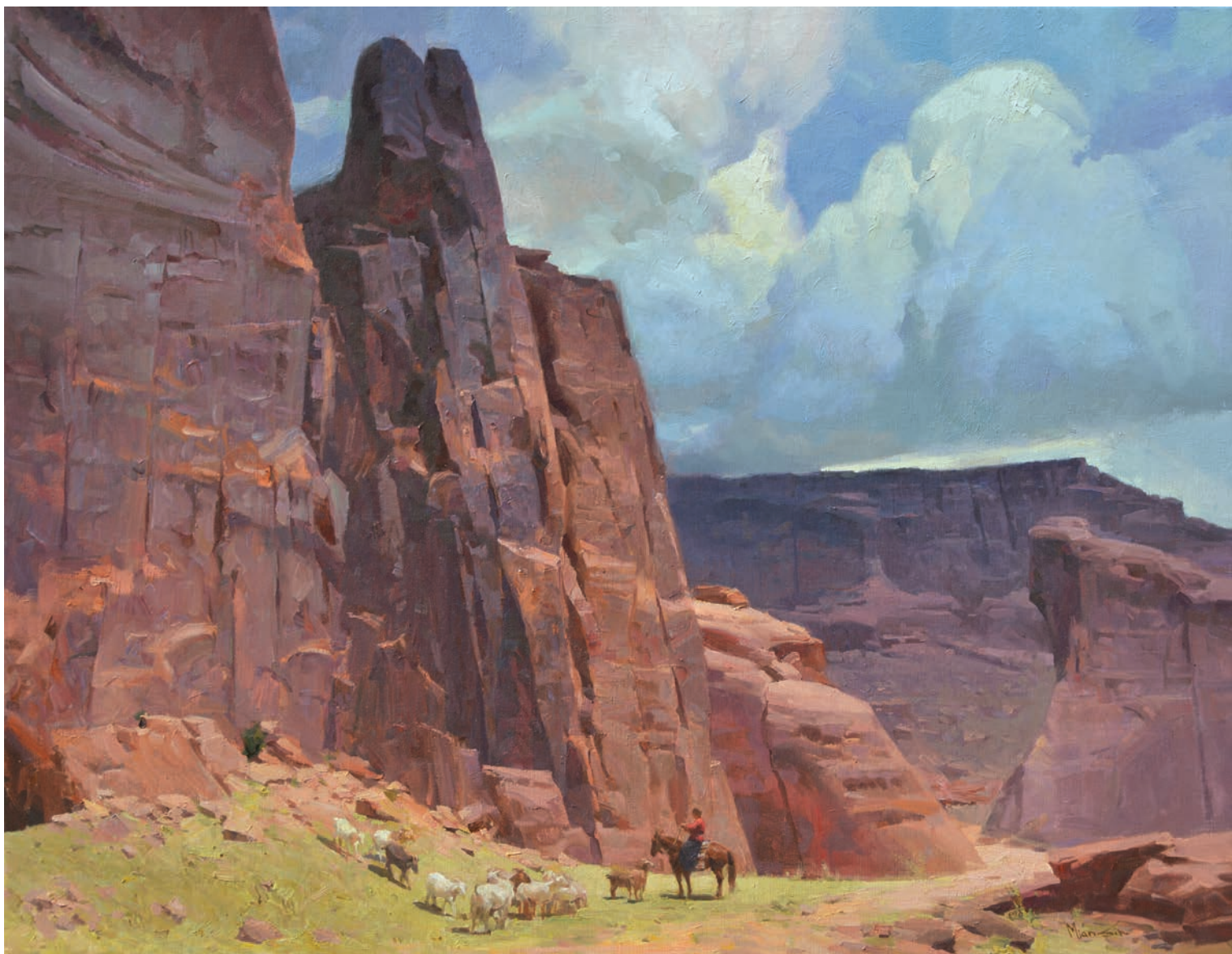
MIAN SITU, Leading the Herd , oil on canvas, 22 x 28 inches, $17,500