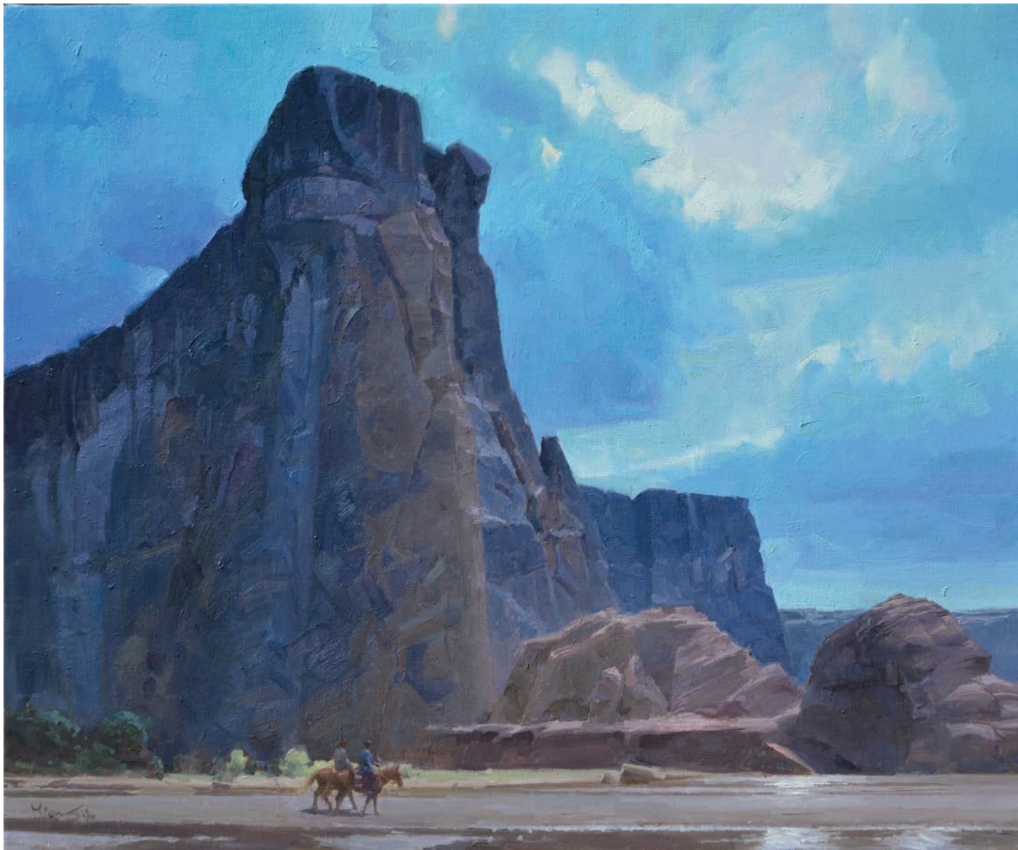
MIAN SITU, Twilight in Canyon Country , oil on canvas, 20 x 24 inches, $14,500