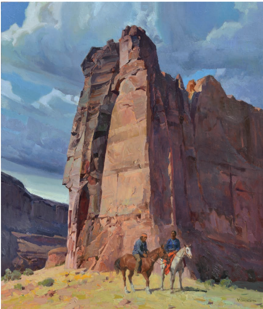
MIAN SITU Riding in the Canyon oil on canvas 28 x 24 inches $19,500