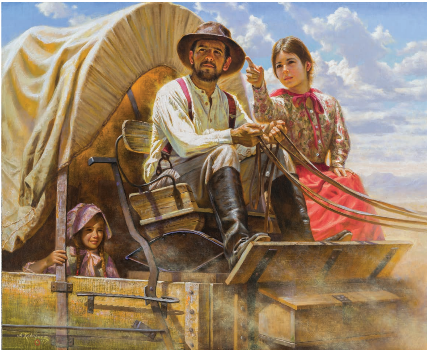
ALFREDO RODRIGUEZ, Traveling The West , oil on linen, 24 x 30 inches, $14,500