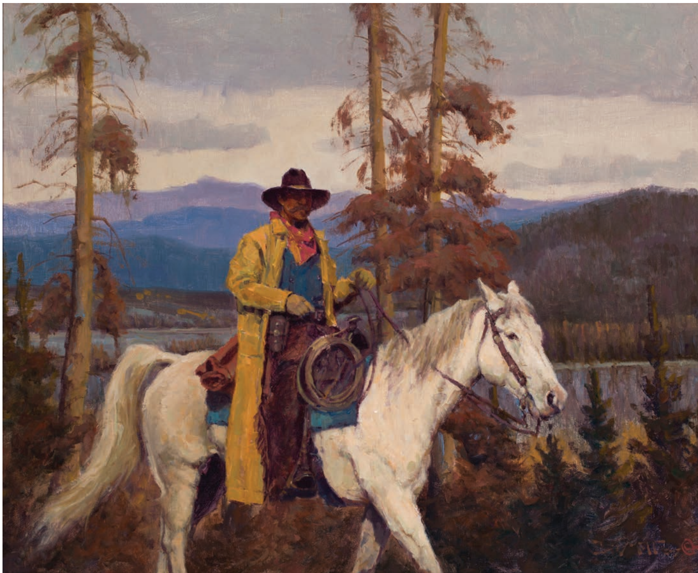
JOHN DEMOTT, Probably Gonna Rain , oil on mounted linen, 16 x 20 inches, $8,500