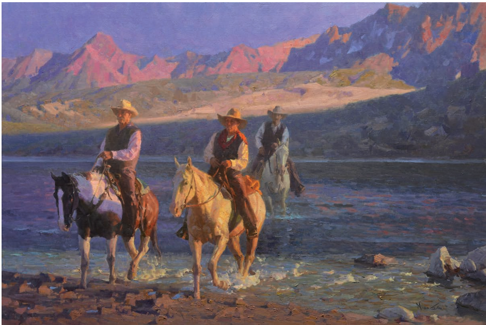
MIAN SITU, Twilight Crossing , oil on canvas, 24 x 36 inches, $24,500