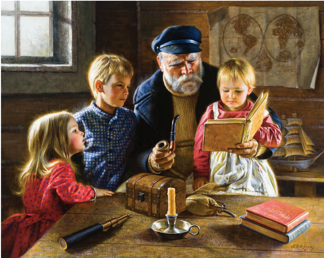
ALFREDO RODRIGUEZ, A Fanciful Voyage With Grandpa , oil on linen, 24 x 30 inches, $14,500