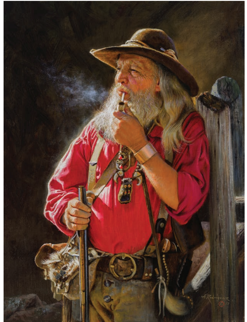
ALFREDO RODRIGUEZ, Contemplating , oil on linen, 16 x 12 inches, $6,500