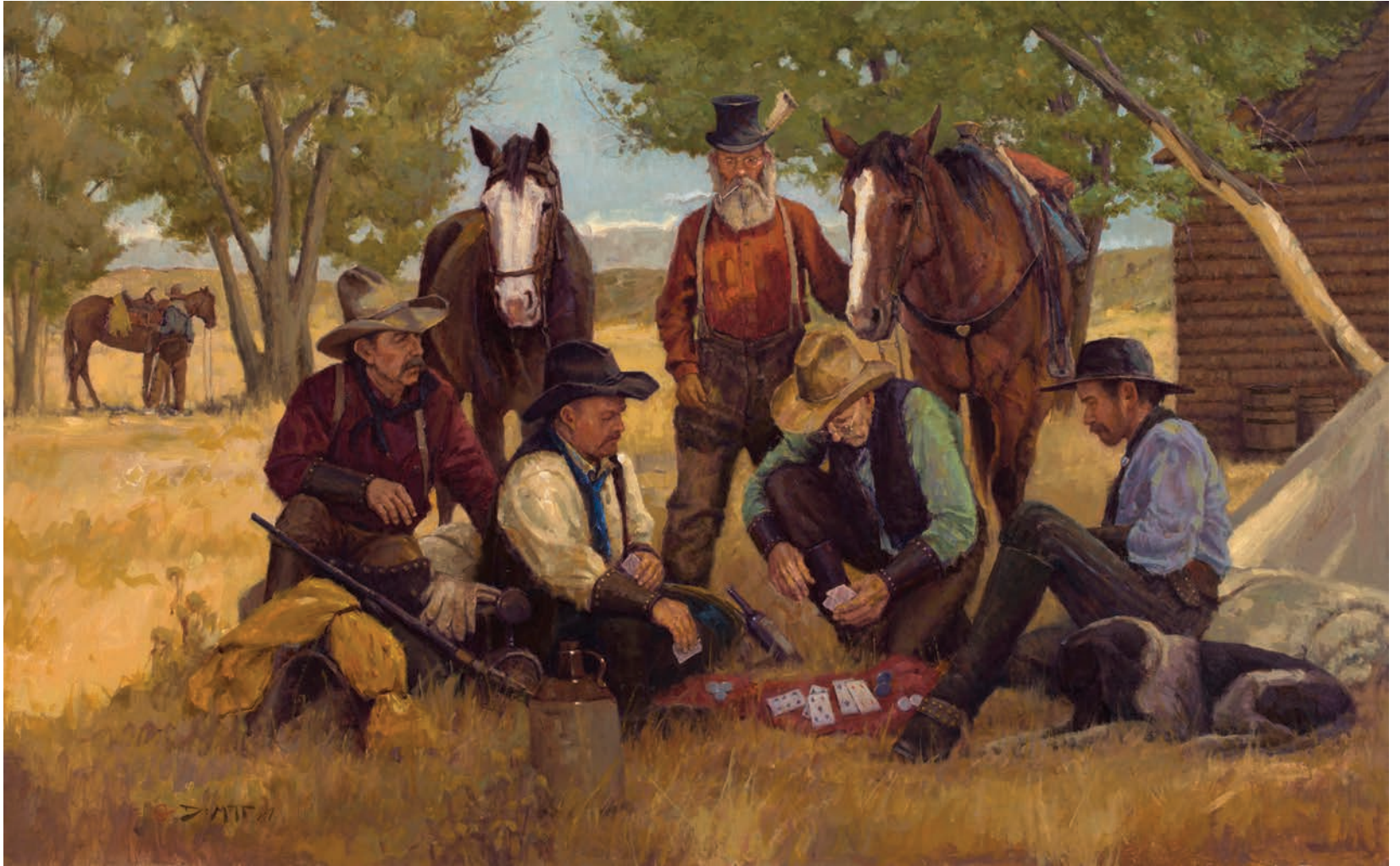
JOHN DEMOTT, Texas Hold Em , 1900, oil on board, 30 x 48 inches, $45,000