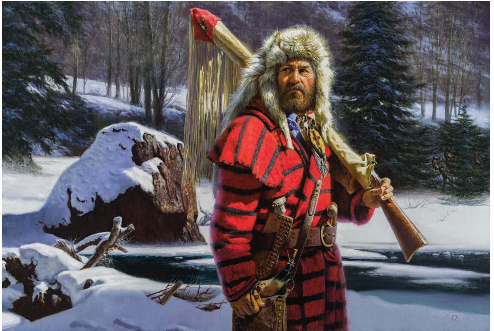
ALFREDO RODRIGUEZ, Unaware , oil on linen, 20 x 30 inches, $12,000