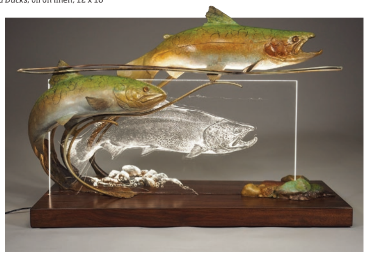
\textbf{Dan Chen}, \textit{The Journey of Return}, \textit{bronze}, \textit{Lucite}, \textit{wood and LED}, 21 \times 32 \times 12"