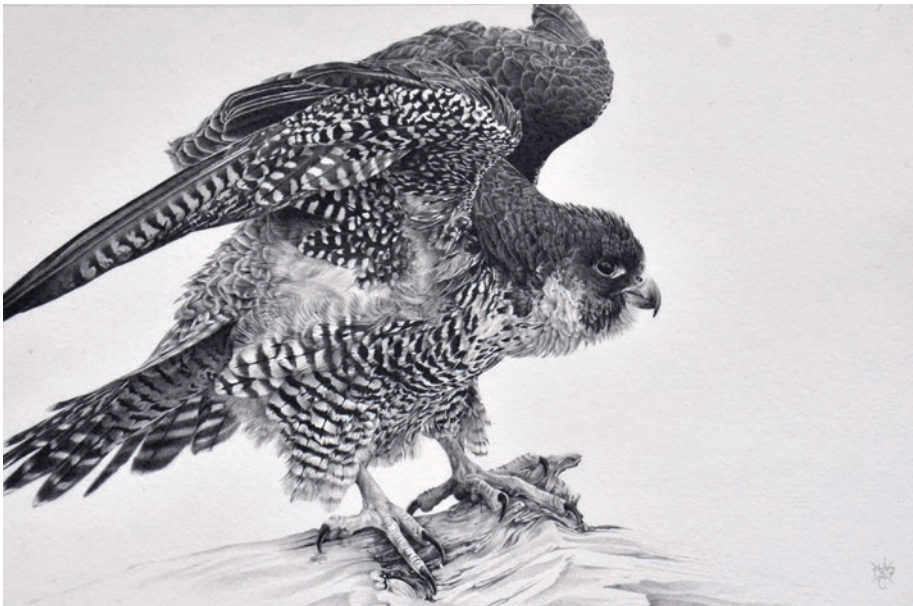
Jamie Cassaboon, Peregrine Falcon #1, graphite on paper, 10½ x 16"