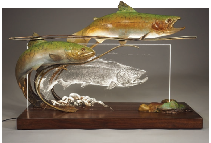
Dan Chen, The Journey of Return , bronze, Lucite, wood and LED, 21 x 32 x 12"