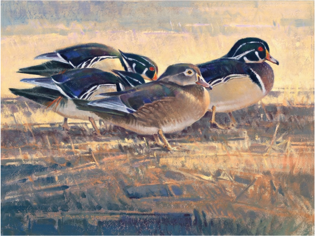
James Morgan, Center of Attention, Wood Ducks , oil on linen, 12 x 16"